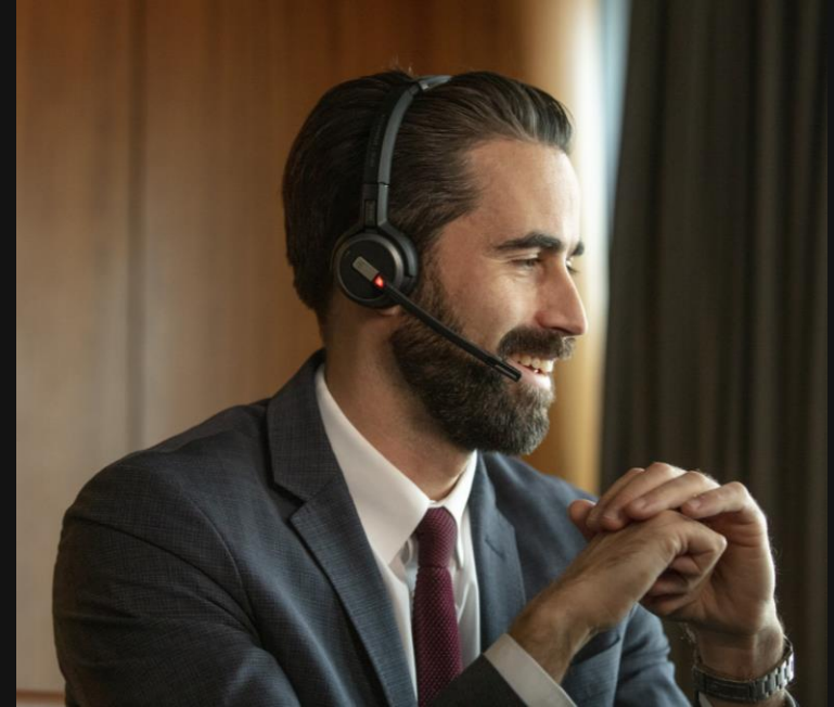
Passion for Performance