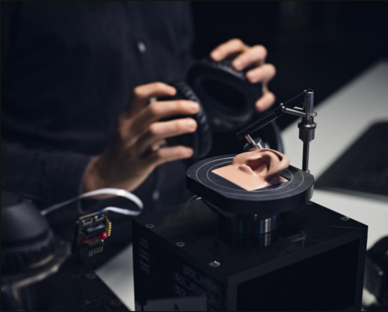
Pioneering Audio Technology