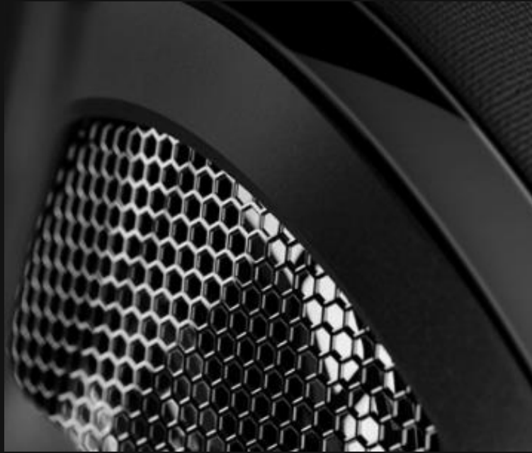
Crafted to Last, Designed to Excite